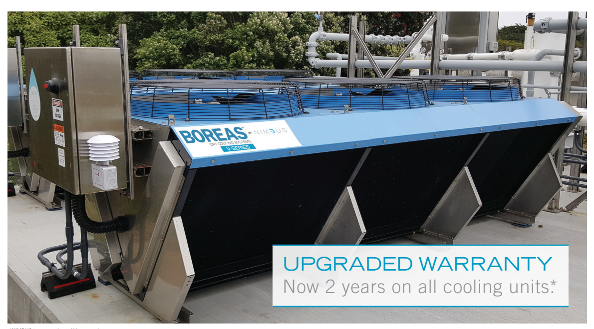
*NIMBUS terms and conditions apply

NIMBUS® provides BOREAS® V-Series™ Dry Cooling Systems for customers who operate with lower dry bulb temperatures and/or higher outbound process fluid temperatures. BOREAS® systems are designed to deliver safe, dependable, rugged, and efficient process cooling.